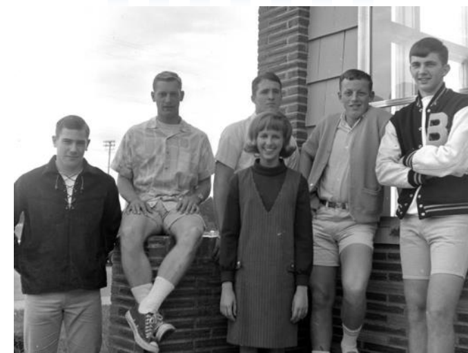
Class of 1967 Officers