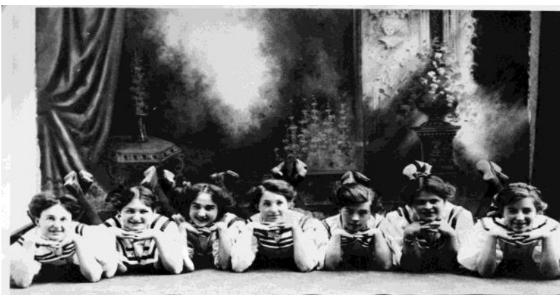
The 1908 Bandon High girls' basketball players visited a photo studio to have their team picture taken.

The girls' basket ball team of the high school met the North Bend high school team in a game at North