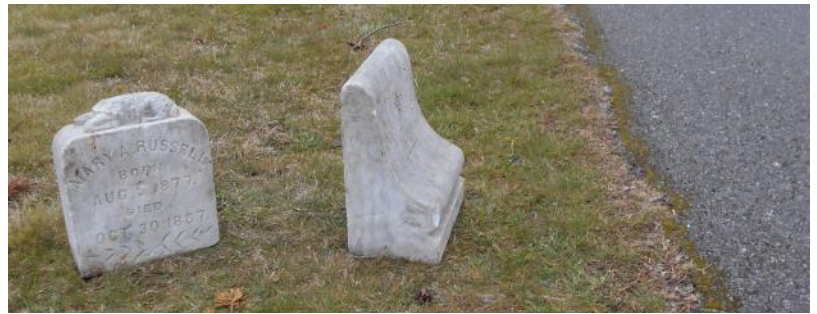
In the Averill Cemetery — suspiciously close to the road