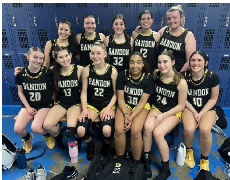
The Bandon High 2024 girls' basketball team finished the season undefeated in league play, earning a trip the state tournament.

The vanquished team in this contest will come to Bandon in about two weeks to endeavor to recover their lost laurels, and the hospitality shown by them Friday will be fully reciprocated.